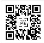
TABLE DECOR CONTEST